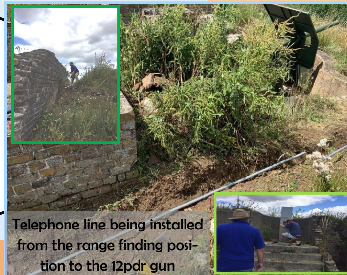
Telephone line being installed from the range finding position to the 12pdr gun