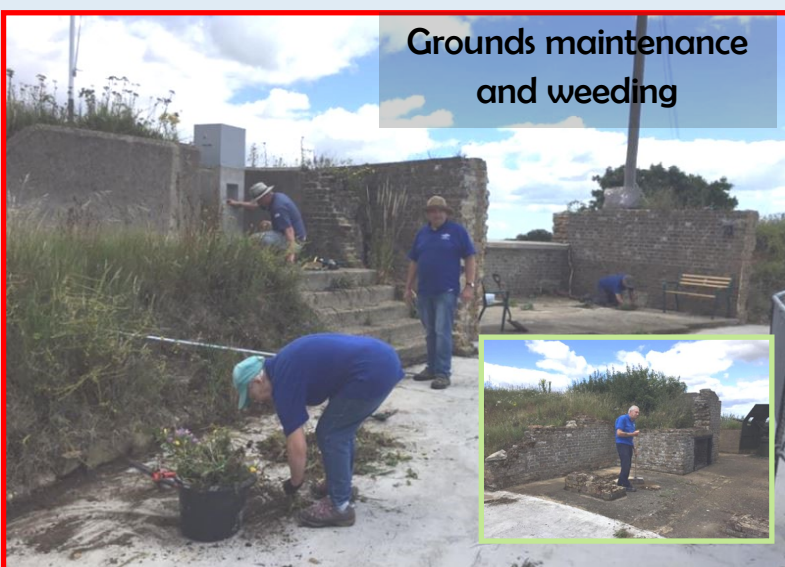
Grounds maintenance and weeding

for social distancing, the caravan was placed out of bounds so a temporary rest area was setup in the main fort for lunch and drinks. Our volunteers didn't go without their normal bacon sand-