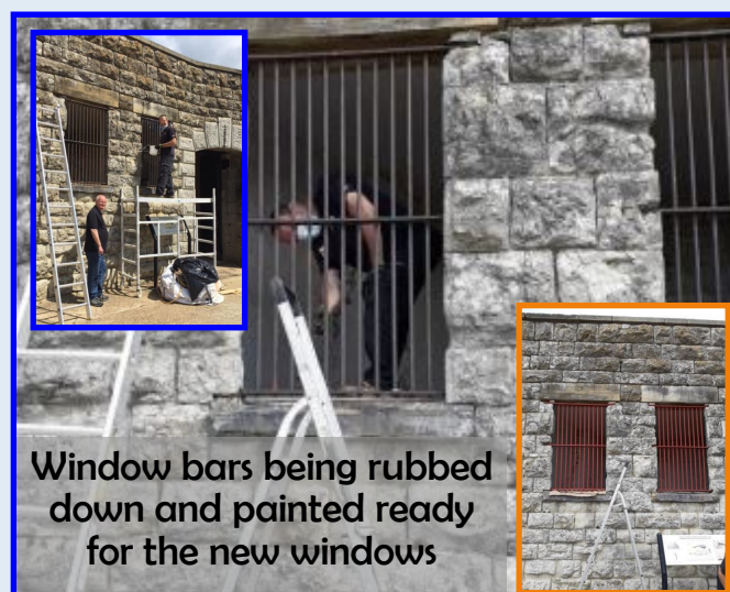
Window bars being rubbed down and painted ready for the new windows