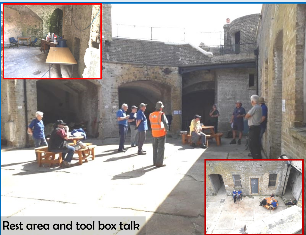
Rest area and tool box talk

Our first workday back saw some major changes as to how we operate. Firstly, we now have limited