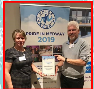
Pride Of Medway