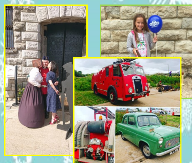
August Open Day