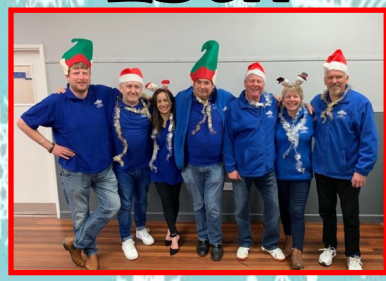
Merry Christmas & Happy New Year from Slough Fort Trust