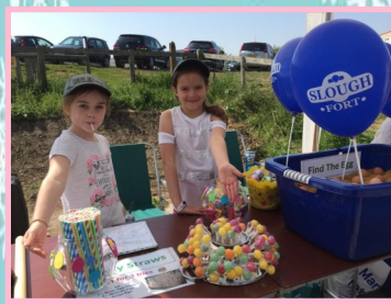
Easter Open Day