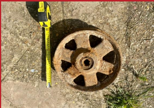
Was this wheel uncovered from the western Moncrieff gun ?