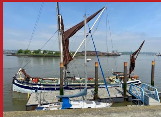
A trip was taken by some of the volunteers and Trustees aboard The Edith May, a Kentish barge