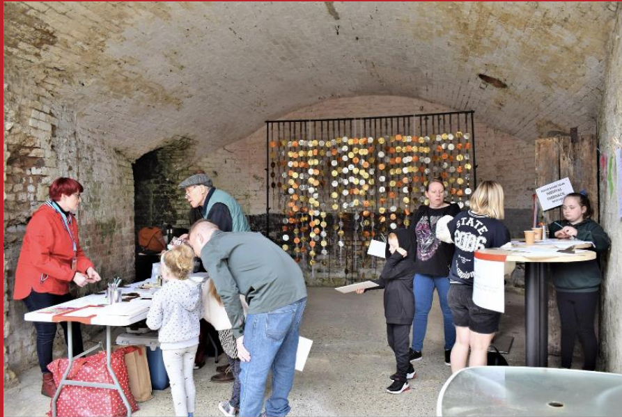
May 2023 the fort hosted a free to the public Heritage Festival