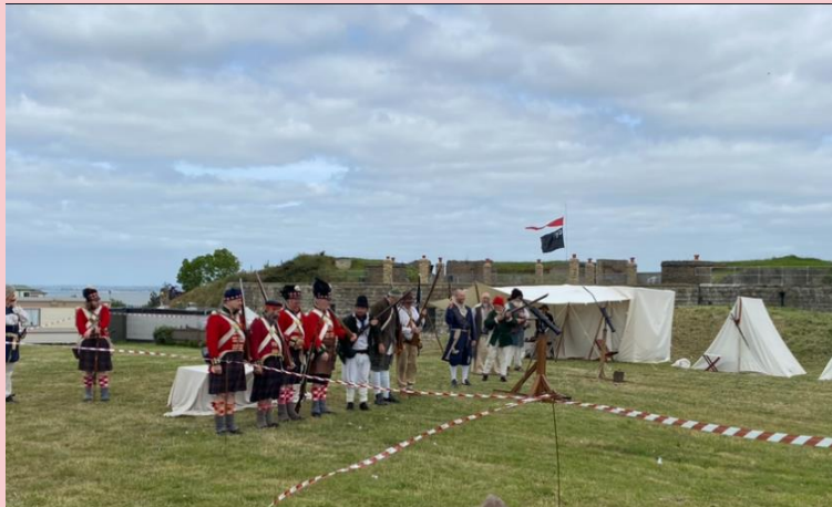
More of the pirates and red coats, May bank holiday

Children were also shown how to fight with a foam sword, then let loose in the arena, good fun was had by all over the weekend.