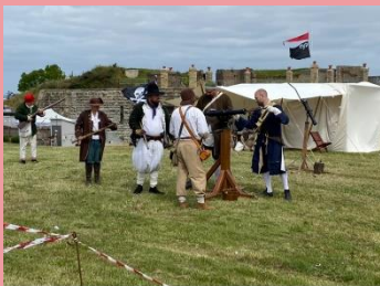
Pirate weekend at the fort May 23

The Sheppy Pirates set up for a long weekend at the fort for the late May bank holiday.