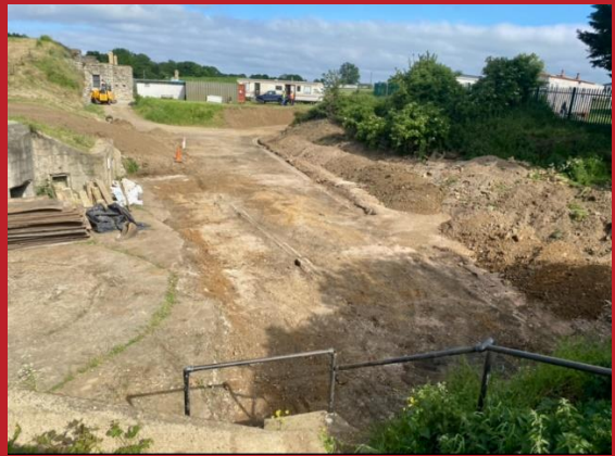
The work started on digging out the western roadway