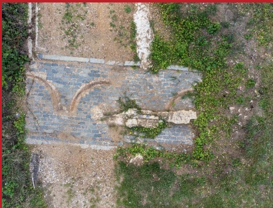
The cobbled entrance was exposed