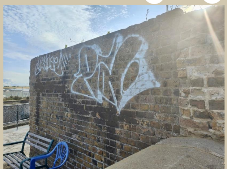
July 2023 Graffiti at the fort

Unfortunately, one Sunday we came in to find silver graffiti sprayed all over the front of the Fort. This was very disheartening to all of us after the many hours put in to restore the Victorian Fort.