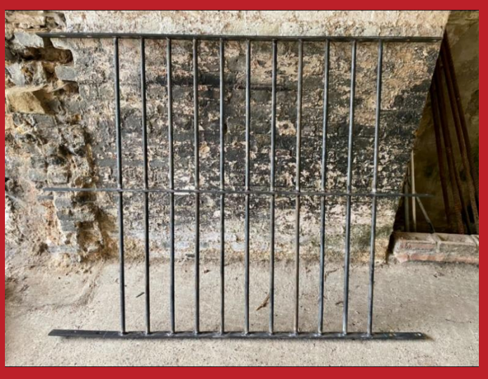
New window bars are made where required