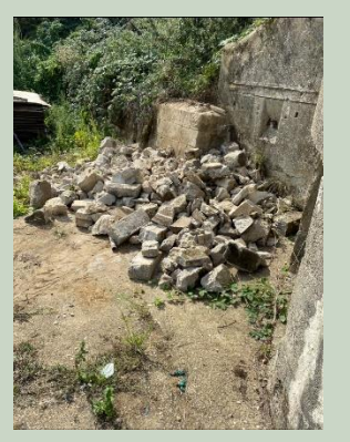
More work begins at the western gun position, September 23