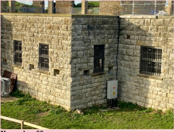
November 23 4 sets of windows and bars have now been installed to weatherproof more rooms to enable restoration to continue during the winter months.

In the background the Trustees continue to work towards our Lottery grant application, to be submitted next year.