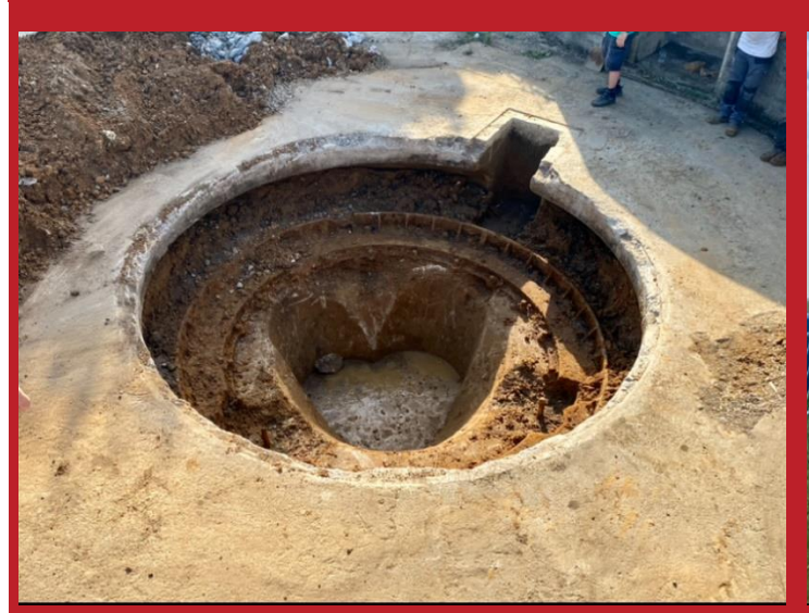
The gun pit and traversing ring revealed