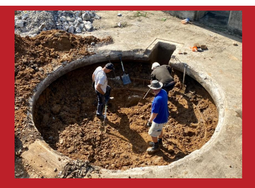
September 2023 work commences to reveal what is left of the western Moncrieff gun position