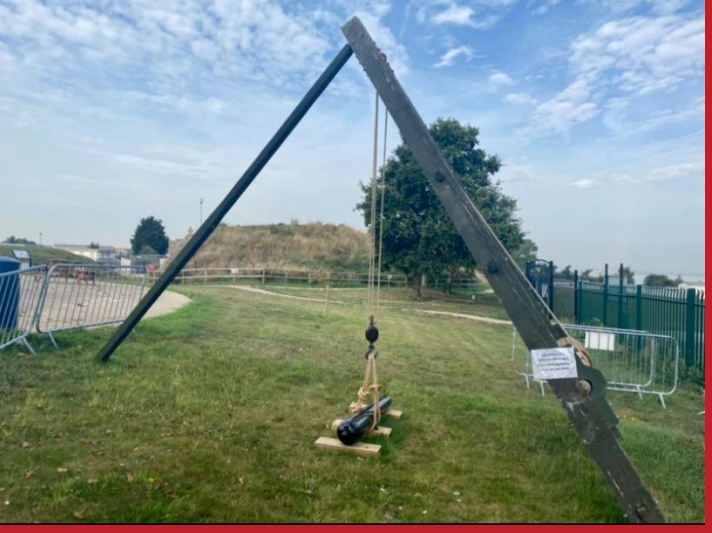
A replica \operatorname{\mathsf{Gyn}} lift is constructed complete with tackle