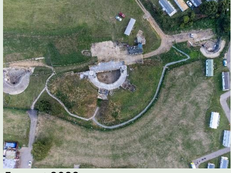
August 2023 We were lucky to have some drone pictures taken of the fort and grounds