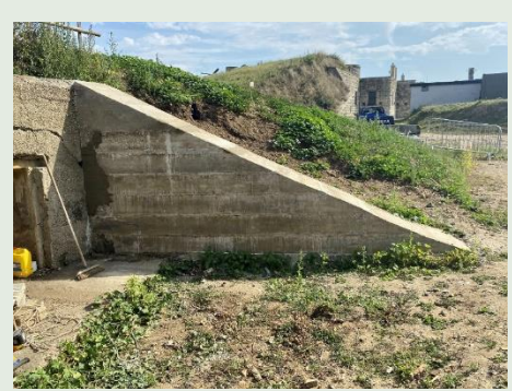
Concrete retaining wall is complete